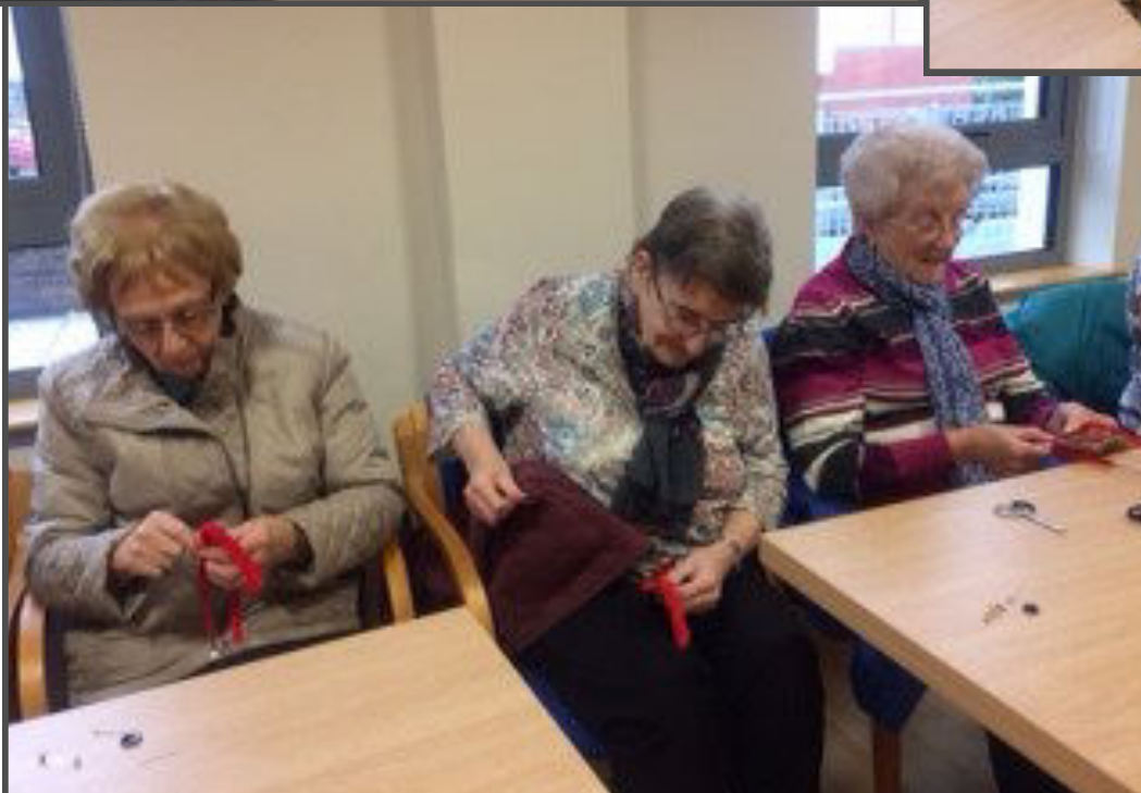
Members hard at work....